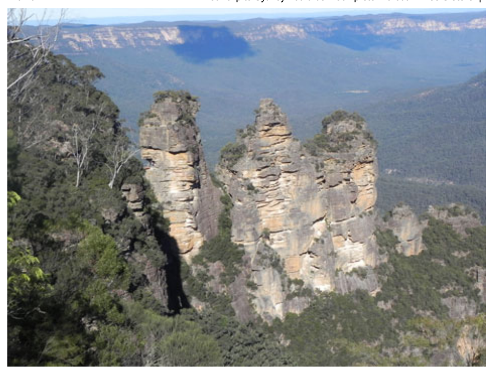
Awesome Three Sisters

Blue Mountains with its ensemble of spectacular gorges, streaming waterfalls, enchanting mountain caves, lush rainforests and expansive tablelands and rolling valleys, is a great outdoor place any time of the year. It glows in autumn, chills in winter, bursts with colour in spring and refreshes you in summer. The domain is densely populated by oil bearing Eucalyptus trees releasing finely dispersed droplets of oil that combine with dust, vapour and sunlight to give the atmosphere a bluish haze and thus the name. An area said to be ten times older than the Grand Canyon, the Blue Mountains region was World Heritage listed in 2000, in recognition of its geographic and cultural importance.