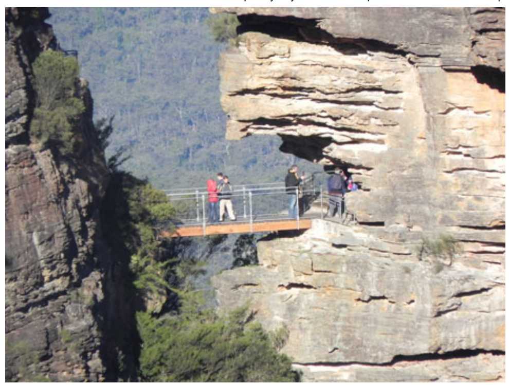
Breathtaking cliffs

There are no shortages of things to do when there, walking through bush-filled mountain paths being the most popular exercise.