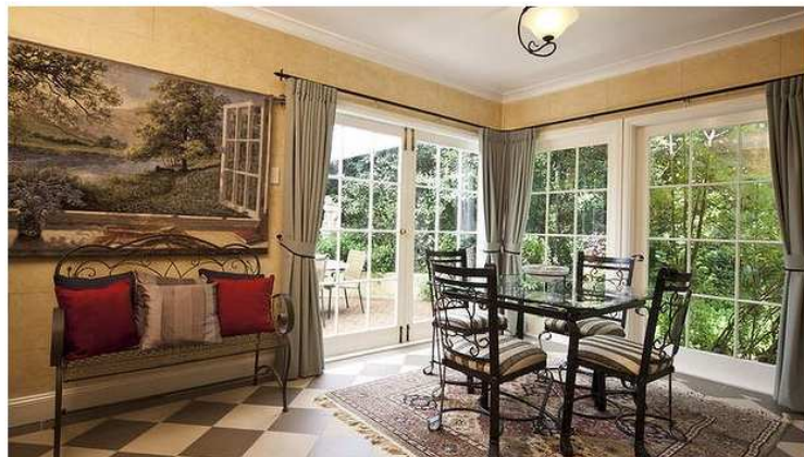
Strawberry Patch cottage in Leura.

All talk of children is silenced as Bellinda Kontominas indulges in the grown-up pursuits of massage and magazines.