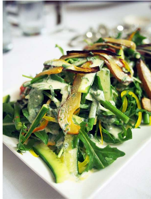
rocket salad with pear, asparagus & blue cheese dressing