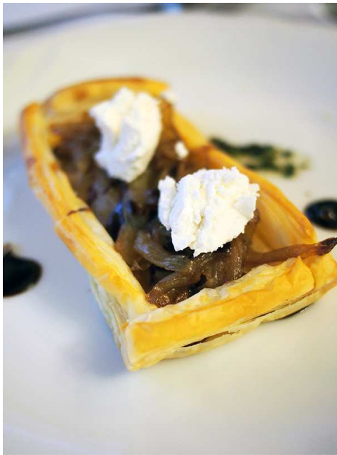
warm tartlet of braised caramelised onion & soft goat's cheese