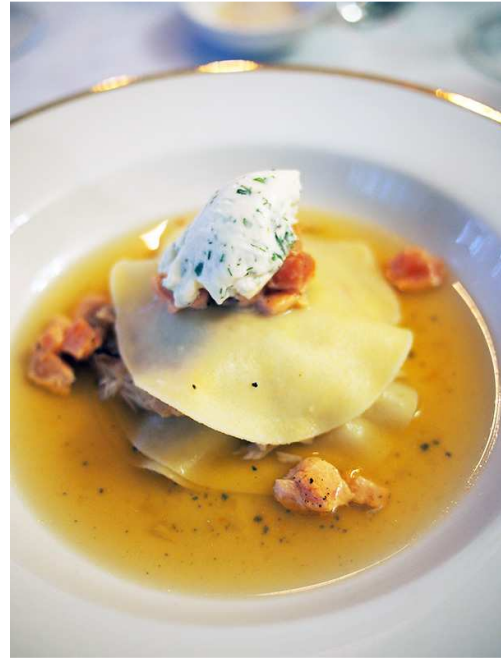
salmon & crab lasagne with herb mascarpone, semi-dried tomatoes & roasted garlic broth