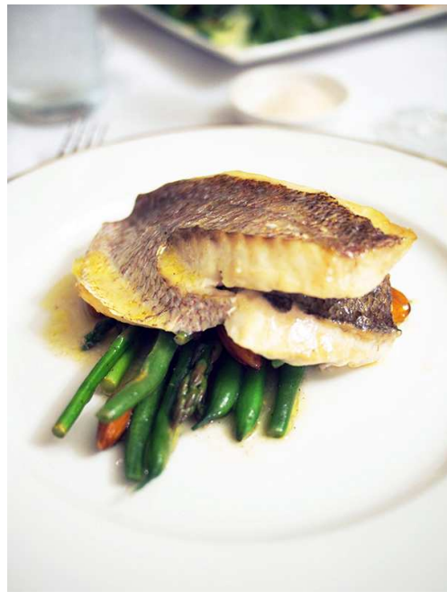
grilled snapper fillet on a salad of green beans, asparagus & roasted almond with lemon dressing