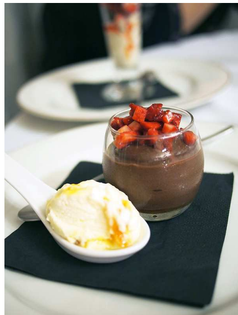
double chocolate cointreau

You organise your menu before arrival. I had the salmon & crab lasagne as well as the snapper which were beautifully cooked. There were a range of wines served to accompany our meal, all Australian. I also had the strawberries romanoff which had the surprise of chocolate strawberry jam mixed into the cream at the bottom of the glass. Of course, I had to steal a spoonful of the double chocolate cointreau, delicious!