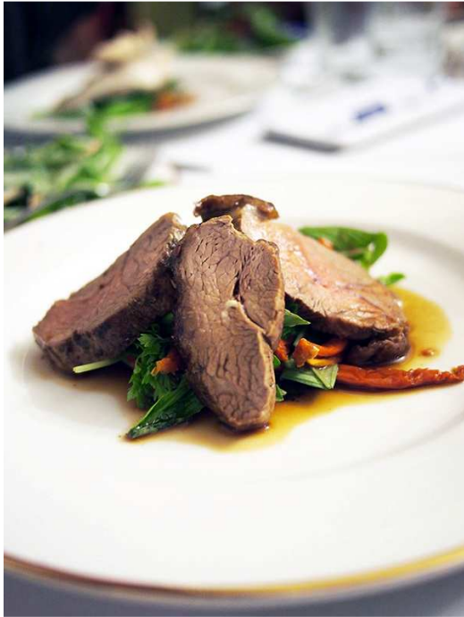
warm salad of roasted lamb rump, fresh herbs, semi-dried tomatoes & crumbed feta with mint basil aioli