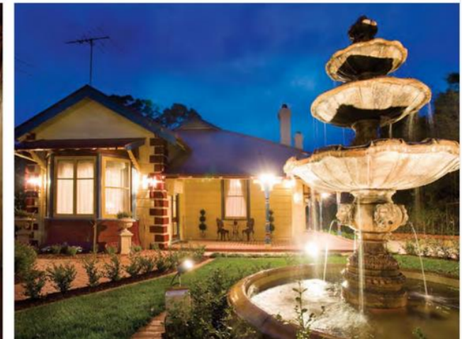
Top three images opposite, and previous page: The Strawberry Patch property. Bottom images: Varenna Property